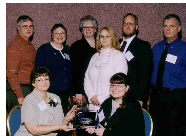
Outstanding Youth Volunteer Fundraiser, the Brockport HS Leukemia Dance Marathon Committee

National Philanthropy Day is a great opportunity to recognize and thank donors, volunteers and fundraisers. Each year we are building more visibility into the event and we encourage you to submit nominations for 2004 National Philanthropy Day. Information on the